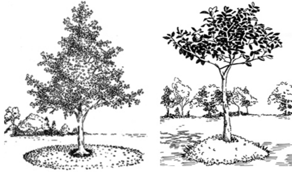
Correct Mulching Incorrect Mulching

The recommended mulching depth is 1 to 3 inches. Spread mulch out to the tree's drip line or beyond. Avoid placing or "coning" mulch against tree trunks. Piling mulch against the trunk can cause stress to the tree and lead to insect and disease problems.